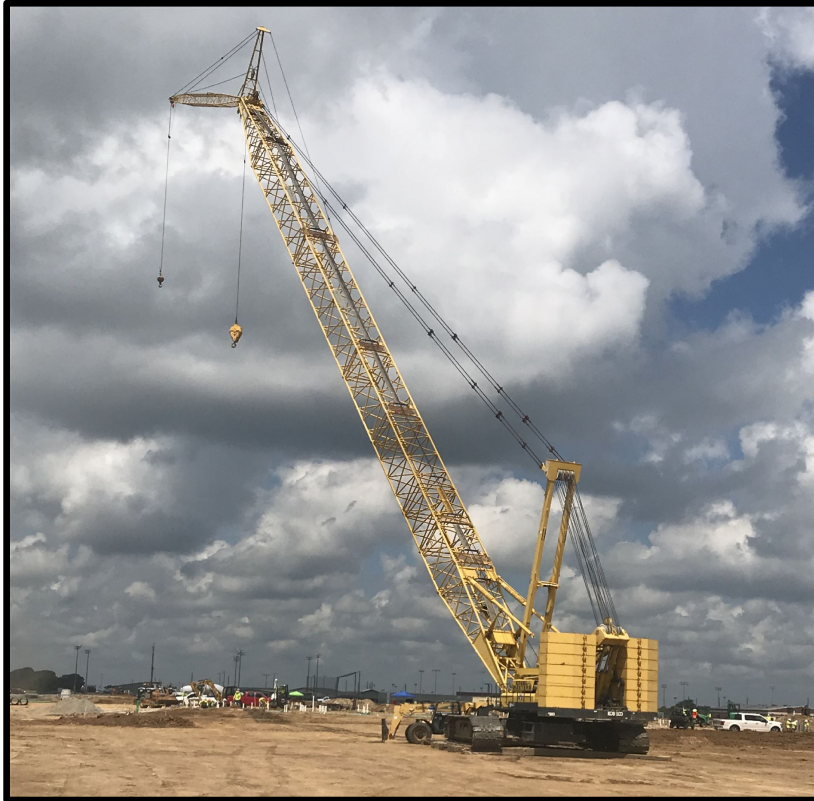
Crane Assembled awaiting Steel