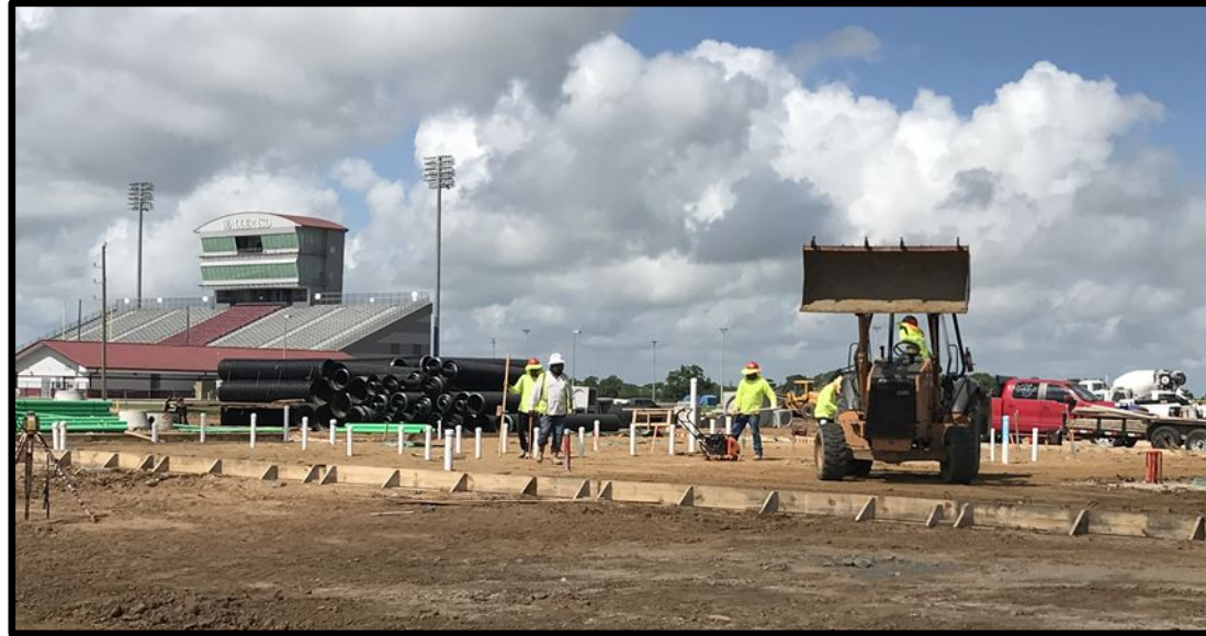
Preparing for Slab on Grade (SOG)